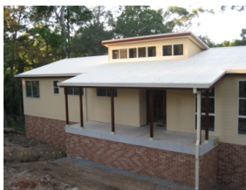
(Our home from front)

After long service leave and holidays for 3 months it is good to be back at work.